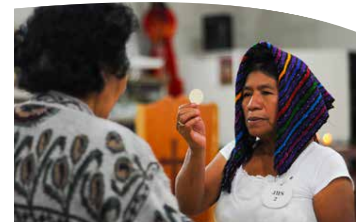
This year the Diocese of Helena's Guatemala Mission marks its 50th anniversary! Help support the mission by contributing to its endowment fund at the Foundation.