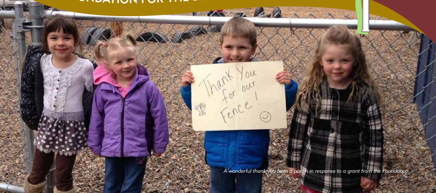
A wonderful thank you from a parish in response to a grant from the Foundation.