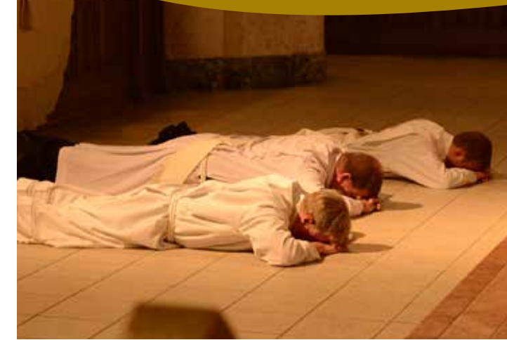
The Foundation manages six endowment funds that support seminarian education. Four of the six endowments were established by individuals in honor of their family.

AT THE FOUNDATION FOR THE DIOCESE OF HELENA